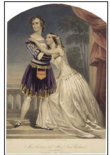
the Cushman sisters as Romeo and Juliet

Just as it has been adapted for centuries following Shakespeare, Romeo and Juliet takes its story and subject matter from a long tradition of previous romances. The plot is based on an Italian tale translated into a 3,020-line poem as The Tragical History of Romeus and Juliet by Arthur Brooke in 1562; it was retold in prose in Palace of Pleasure by William Painter in 1567. Shakespeare may also have known of the Italian version Giulietta e Romeo , written by Luigi da Porto in 1530, who was the one to originally set the tale of Romeo and Juliet in Verona, Italy.