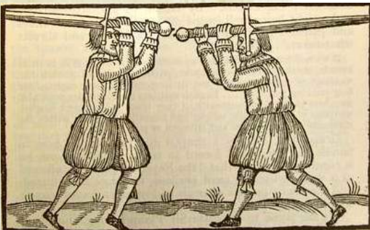
a 1917 illustration of a classic Shakespearean duel