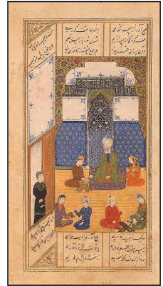
a miniature from the famous 1431 Persian manuscript of the Khamsa

Qays takes on the moniker "Majnun" - literally translated in English as "madman". His obsession grows to the point that he sees and evaluates everything in terms of Layla. In time Majnun runs away into the wilderness, becoming unkempt, not knowing good from evil. His father takes him on pilgrimage to Mecca, to seek God's help in freeing him, but Majnun strikes the Kaaba (a building at the center of Islam's most sacred mosque, and the most sacred site in Islam). When Majnun realizes that he cannot completely regain his mind even when other people intercede for him, he grows disillusioned with society and roams naked in the desert among the beasts. Contemplating the image of Layla increases his love so that he cannot eat or sleep; his only activity is thinking of Layla and composing love songs for her. Many come to hear him, and some write down the poems he spontaneously speaks.