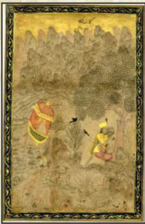
Layla and Majnun from an 18th century Khamsah

The story of Layla and Majnun is an eternal and tragic one that lived through the ages, travelled through the world, entered many cultures and influenced a lot of them. Among the most famous works of literature inspired by Layla and Majnun are the German love story Tristan und Isolde ; the French Aucassin et Nicolette ; and finally Shakespeare's Romeo and Juliet .