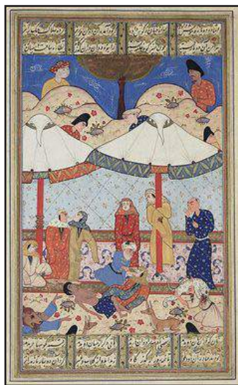
a late 16th-century illustration of Layla and Majnun meeting for the last time before their deaths