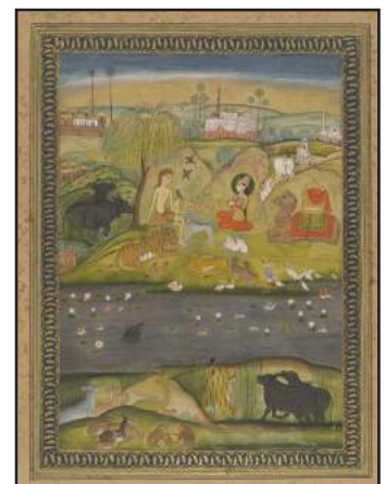
"Layla visits Majnun in the wilderness" Indian watercolour held by the Bodleian Library