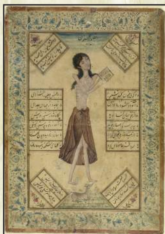
a 19th century "Image of Majnun" in which Majnun is surrounded by text blocks containing 20 lines of Persian poetry from various sources, all referencing the story of Layla and Majnun

Meanwhile, Layla holds their love quietly so none will know. Refusing suitors, she writes answers to his poems and casts them to the wind. It happens often that strangers find these little papers, and guessing their hidden meaning, realize for whom they are intended. Some go to Majnun hoping to hear, as a reward, some of the poems which had become so popular.