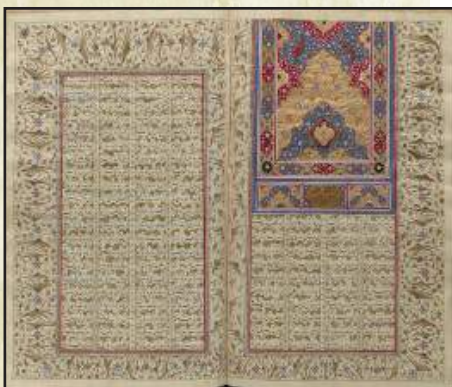
the opening of Layli va Majnun in Nizami's Khamsah

— Pir-o-Murshid Inayat Khan, Sufi poet, 1882-1927